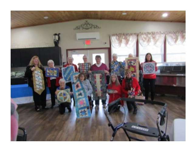
Finished "Rip It" projects